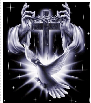
Father, Son, and Holy Spirit