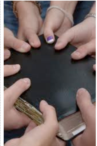
The Bible Teaches the Trinity