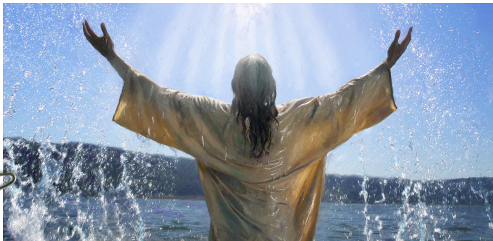
Three Distinct Persons at Jesus' Baptism

It is important that we know what we believe and we know why we believe it. We are Trinitarians, not because of Church councils, or traditions. We are Trinitarian because the Bible teaches it.